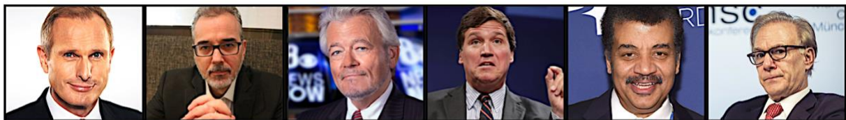
Journalist Ross Coulthart