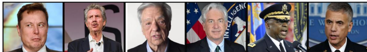
Trillionaire Elon Musk